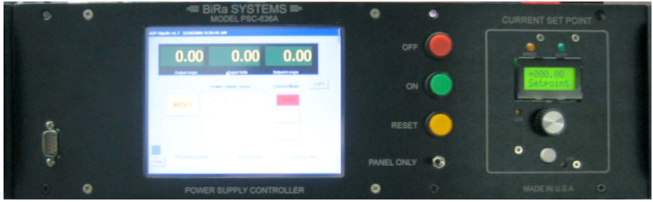
Figure 1: Actual Control Panel

Controls are housed in a 3U 19" chassis. The operator interface consists of a Windows-CE-based touch screen, control buttons and local set-point adjustment. See Figures 1 & 2.